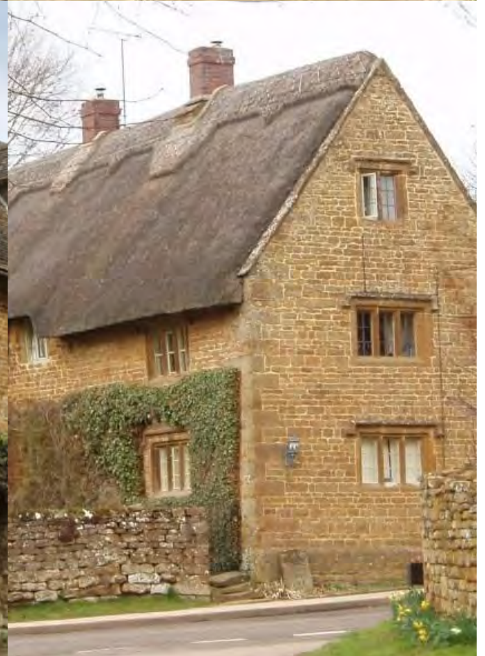
upper lozenge stopped hood-moulds at Cromwells