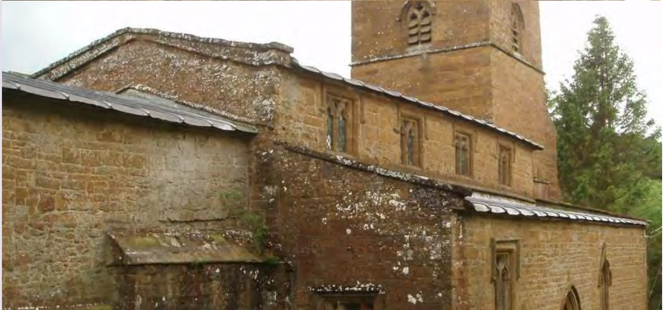
upper Bell Street looking east showing the only terrace of houses in Hornton