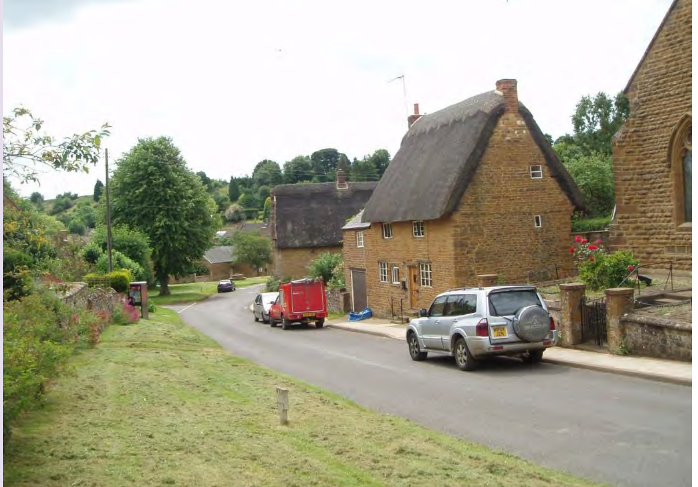
upper The Village Green looking north towards Church Lane (left) and Millers Lane