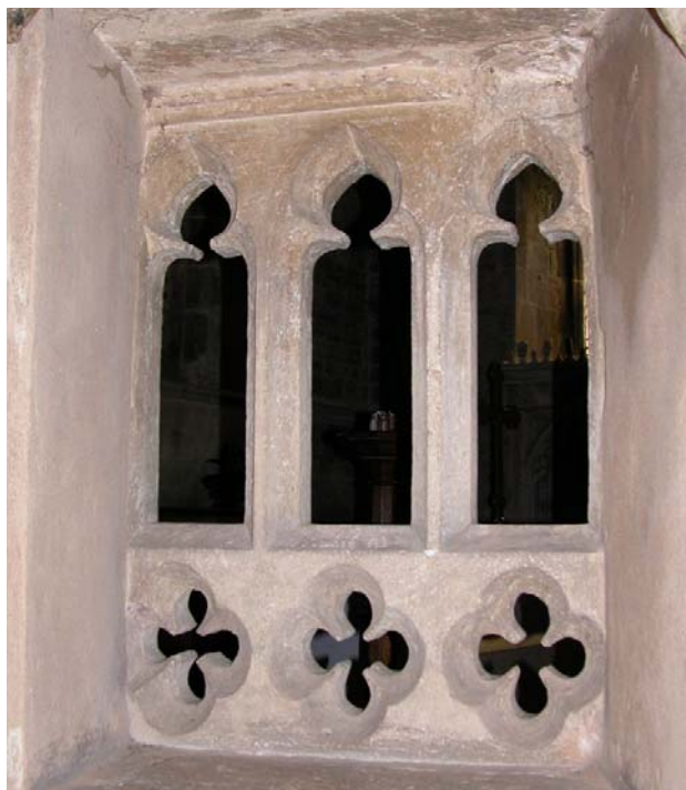
Squint window between chancel and chantry chapel in the church, Chipping Norton. The ‘candle flame’ shape is reminiscent of some recently spotted in barns around Burford