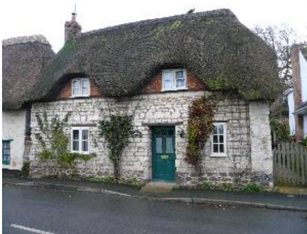
17 th C cottage built of chalk on sarsen base (and attic walls raised in brick).