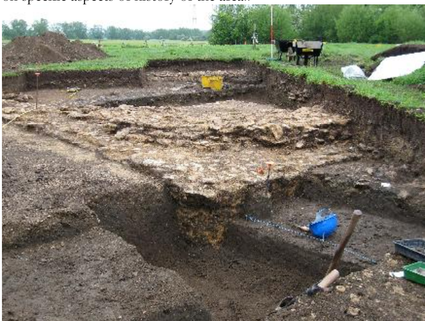
Left: Radcot excavations, looking south-westwards across the excavated corner of the keep.