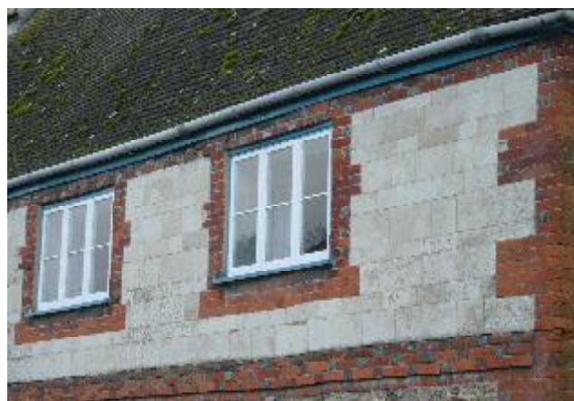
18 th C farm house with brick banding, openings and quoins

Editors note: this form of hard chalk is often referred to by the colloquial name “clunch”