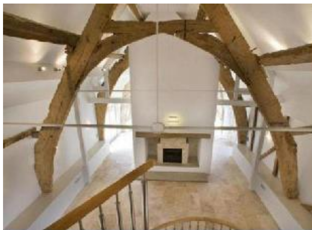
Above: the 14 th C cruck barn at Rectory Farm, Northmoor, W.Oxon, before and after conversion to a cosy home.