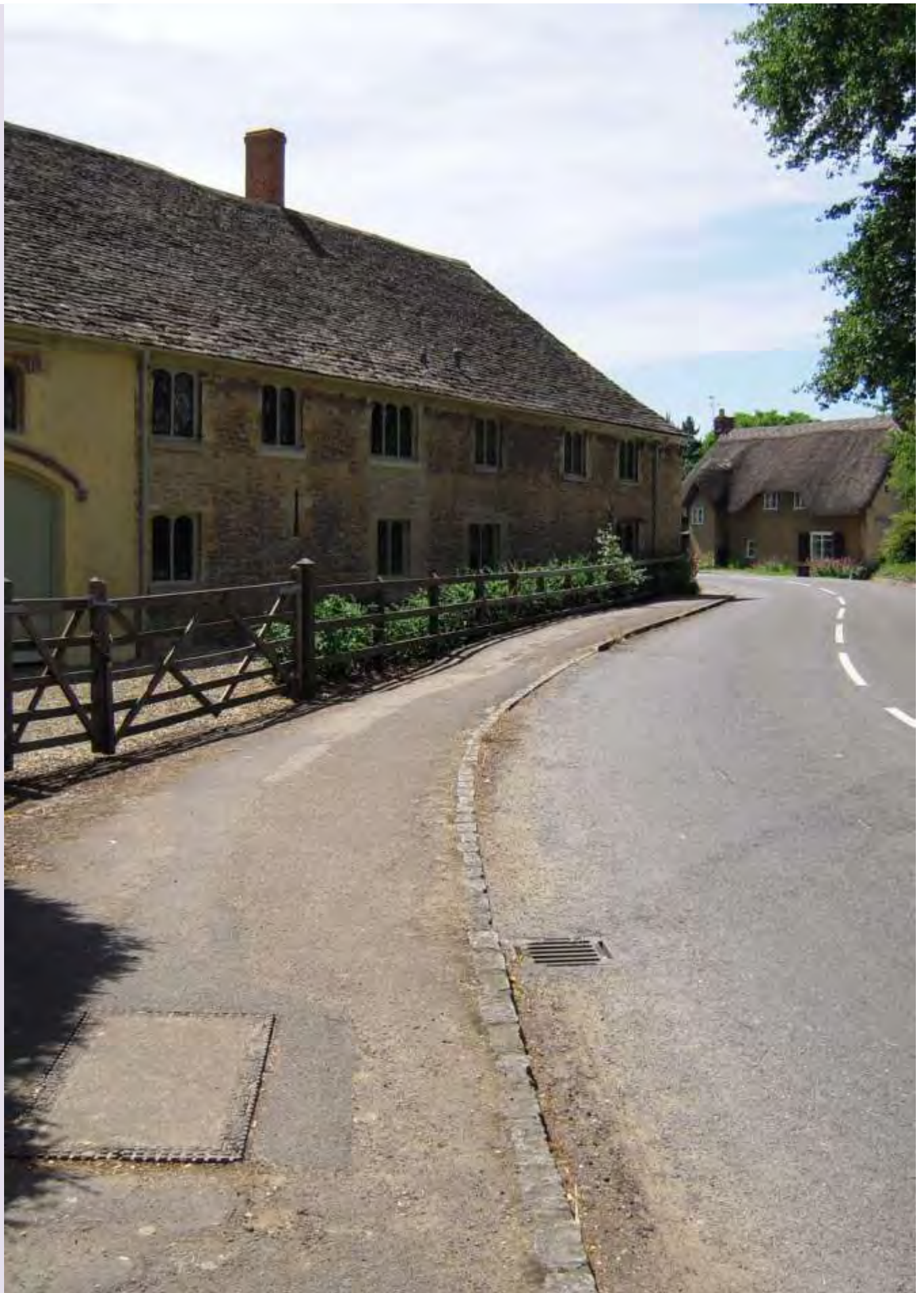
STANTON HARCOURT the Manor House sits amidst thatched cottages