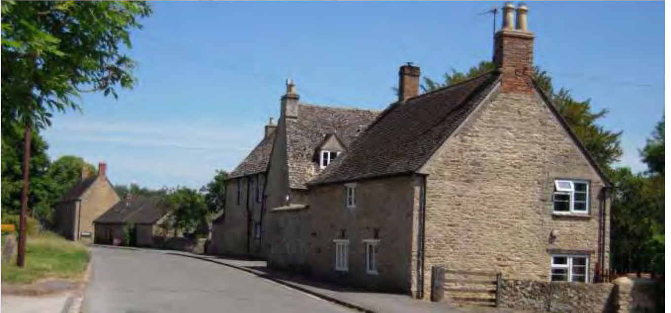
upper Steadys Lane