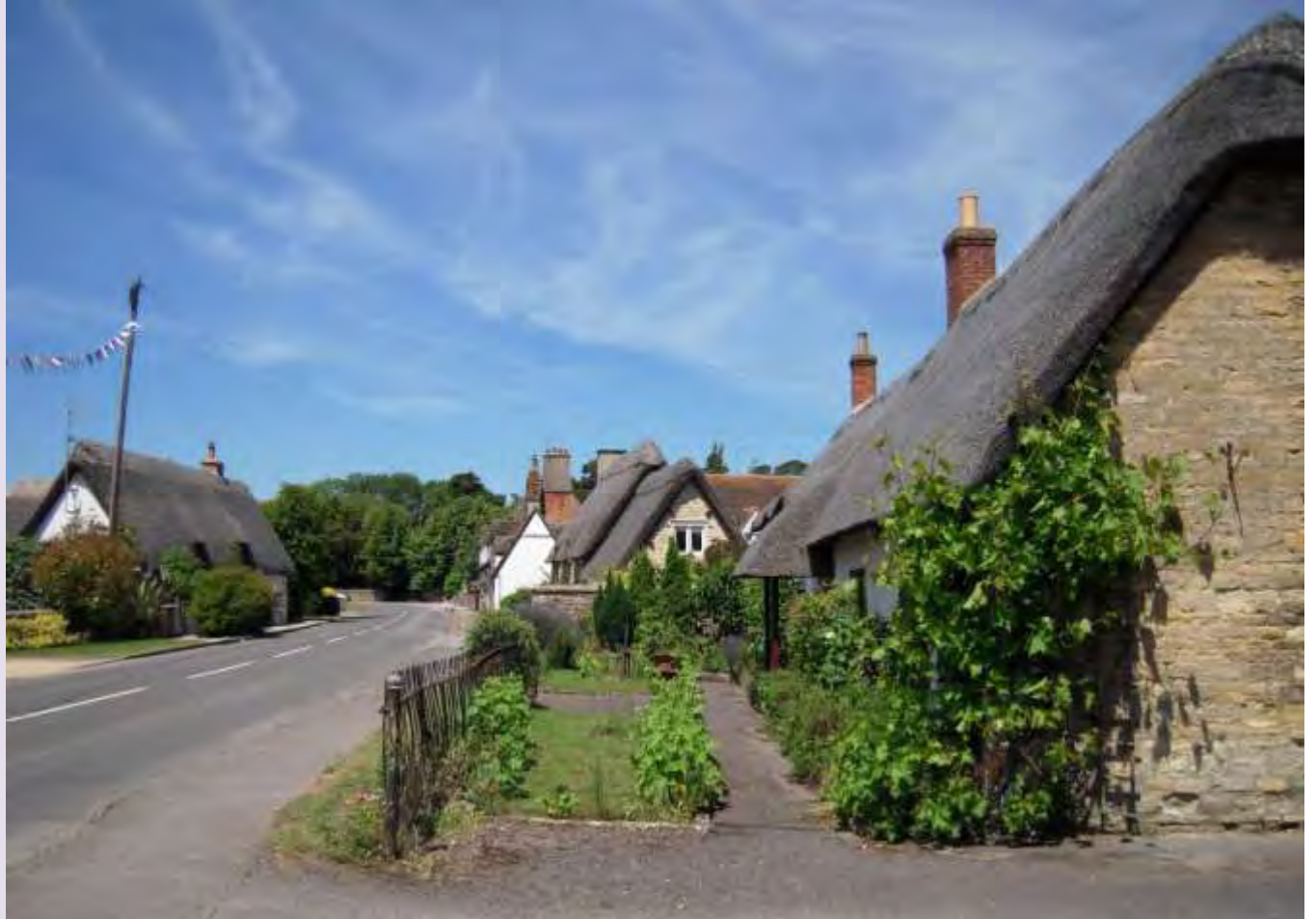
upper the flat landscape at the south end at junction with Steadys Lane