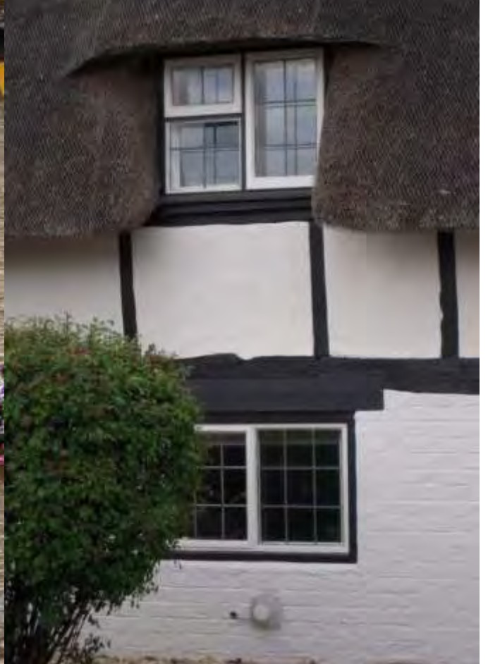
upper cottage in Steadys Lane